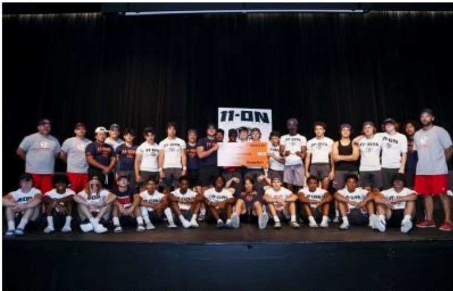
South Elgin High School Football Team

This year, the South Elgin High School football team placed 4 th overall in the Nike 11-On tournament. Out of the 16 high schools that participated and were awarded $1,000 by the Bears to fund the SEHS football program. #sehsproud!